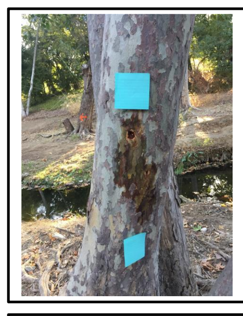
Photo 2 – Photo of the tree trunk showing distribution of holes on trunk and/or branches. If possible, place a piece of brightly colored painter's tape or flagging at the highest and lowest point of distribution. This will be the second tree in your series if your first photo contained a beetle hole. If this tree is absent of beetles, take a picture of the tree's trunk.