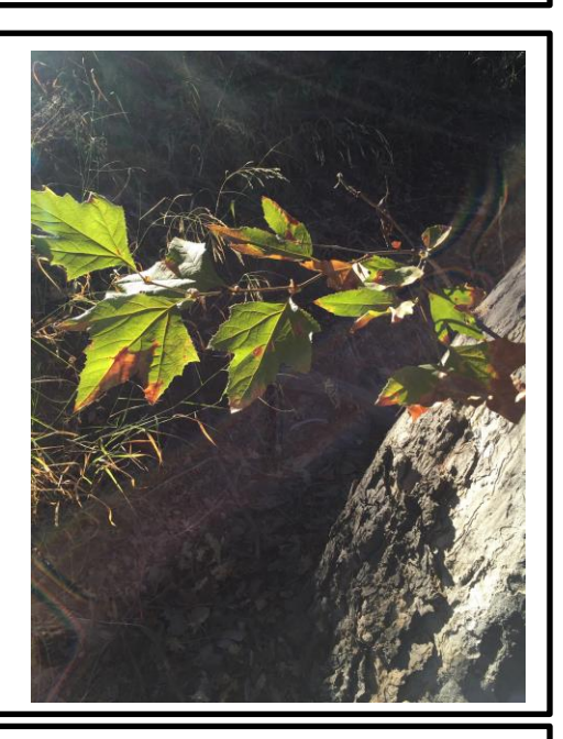
Photo 3 – IMPORTANT: Photo of leaves, flowers, and/or fruit to identify tree species.

Photo 2 – Photo of the tree trunk showing distribution of holes on trunk and/or branches. If possible, place a piece of brightly colored painter's tape or flagging at the highest and lowest point of distribution. This will be the second tree in your series if your first photo contained a beetle hole. If this tree is absent of beetles, take a picture of the tree's trunk.