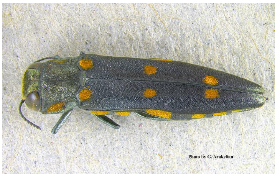
Adult (dorsal view)