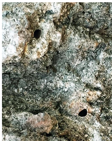
D-shaped exit holes