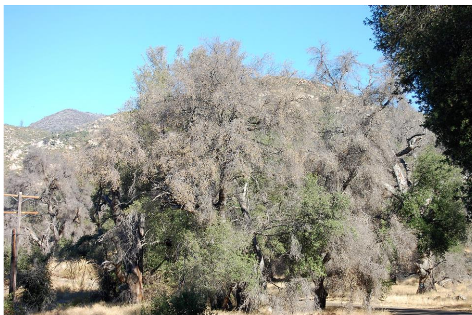
Oaks killed by GSOB